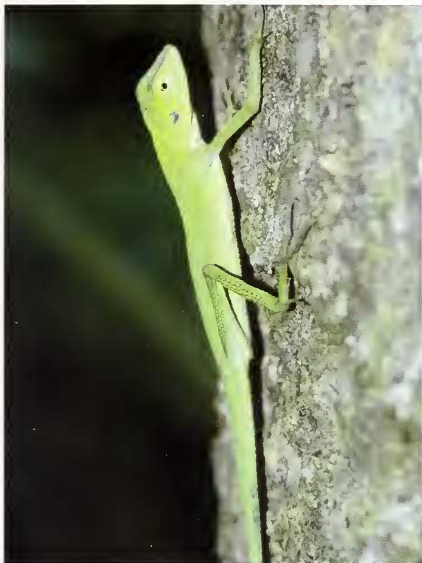
Fig. 7. Bronchocela cristatella from Salibabu Island.